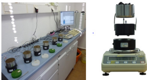
Figure 2 HYPROP for measuring the hydraulic properties.

The EEM enables the simultaneous measurement of the water retention curve and the hydraulic conductivity function. Using new cavitation tensiometers and applying the air entry value of the tensiometer’s ceramic cup, it allows the range to be extended almost up to the wilting point. The measurements were carried out using the HYPROP system. HYPROP 11 is the commercial device to implement the EEM. The total measurement time depends on the soil or substrate and the evaporation conditions and ranged between 3 and 10days. Multiple samples can be measured simultaneously (Figure 2).